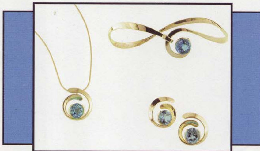
Tom Kruskal -14k Gold and Blue Topaz

JEWELRY, GLASS, FURNITURE AND SCULPTURE DISTINCTIVE WORKS BY CONTEMPORARY THE GIFTED HAND AMERICAN ARTISTS & CRAFTSMEN 32 CHURCH STREET, WELLESLEY, MA 02482 • 781.235.7171 MONDAY - SATURDAY 10 - 5:30 • SUNDAYS 12 - 5 WWW.GIFTEDHAND.COM